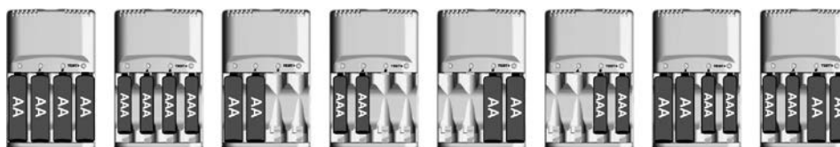
Available Charging Options.